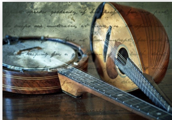
“Old Time Music”