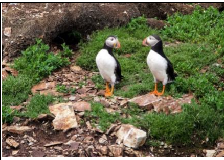
Puffins are only 7-9" tall.