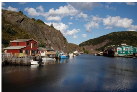
Quidi Vidi fishing village is known for its brewery. Its local lager is brewed with water harvested nearby icebergs.

I've gone with Camera Adventures photo tour company twice to Newfoundland. There are three tours available in summer 2023. I encourage everyone to visit, you won't be disappointed.