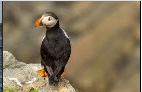
Atlantic Puffins build their nest by digging a shallow burrow or hole.

I've been to Newfoundland several times. It's one of my favourite places in Canada to visit. My preferred time of year to go is late May to early July. Just like Alberta, the weather can change in a minute. It might start out to be a beautiful sunny day, and the next thing you know you're stopping to put a rain sleeve over your camera and lens. I learned firsthand why Newfoundland has been called "the foggiest place on earth." I often had to wait for the fog to lift before heading out to take photos. I've taken trips to Newfoundland both on my own or I've joined a photography tour. I really enjoyed being with a group of like-minded individuals when on a tour. With each trip, I've left a little bit more of my heart there.