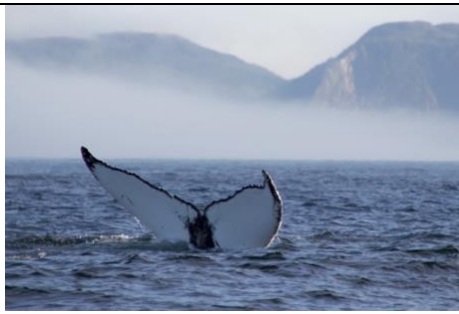
Individual whales can be identified by their unique flukes.