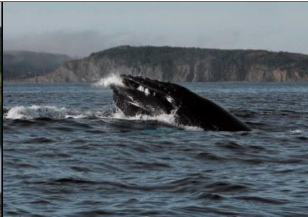
Humpback whales. I took a boat tour with Sea of Whales Adventure located in Trinity, NL.