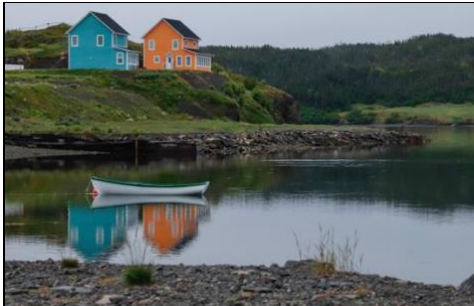
Colourful houses in Trinity, NL.