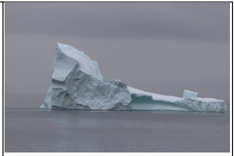
Iceberg at Bacon Cove, an hour outside of St. John's NL.

And what is on everyone's bucket list to photograph when visiting Newfoundland? Icebergs, whales and puffins! The best time I found to view icebergs is late May until late June. St. Anthony, Twillingate, Bonavista and St. John's/Cape Spear are the most popular spots to see the ice giants. When I took a boat tour from St. Anthony , I wasn't disappointed! It was amazing to see and photograph the massive icebergs up close.