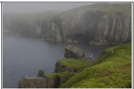
Spillars Cove. The fog gave the scene a Jurassic Park feel.