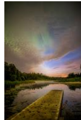
2. Northern Serenity