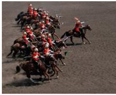
2. Charge of the Light Brigade ©Sieg Koslowski