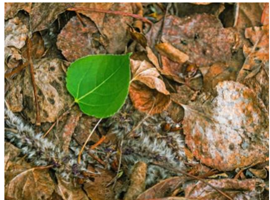
The Last Green Leaf ©Vincent Morban