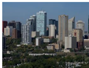
Auto White Balance (AWB)

If, for some reason, you are unhappy with your image(s) due to incorrect or improper white balance settings there are still fixes available. For example, Lightroom and PS Elements offer white balance adjustments (but only for images shot in Camera RAW), and PS Elements and Color Efex Pro offer "Remove Colour Cast" adjustments for all images which neutralize incorrect colour cast.