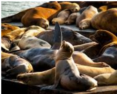
2. Navy Seals