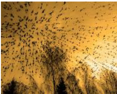
1. The Birds ©Sieg Koslowski