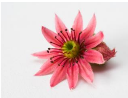
3. In Bloom