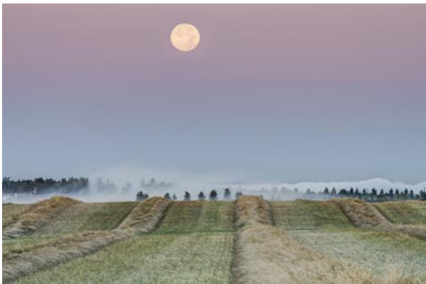
Harvest Moon