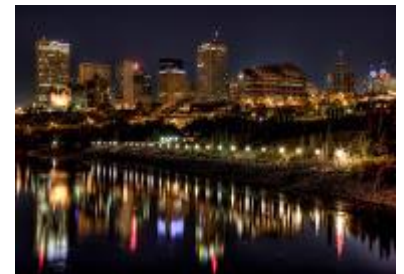
3. A River Runs Through It