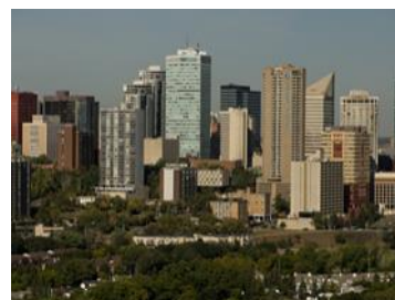
Use of Shade Setting