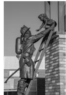
3. Ladder 49