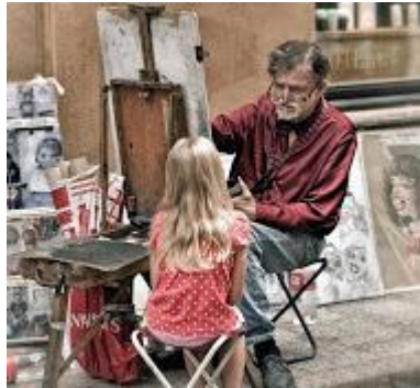
2. The Artist ©Vincent Morban