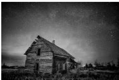
1. Star Trek ©Bill Trout