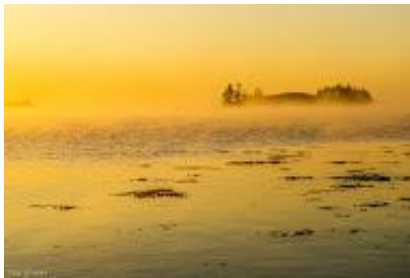
1. East Coast Morning