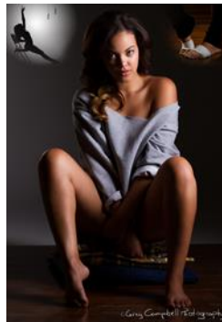
2. Flashdance ©Greg Campbell