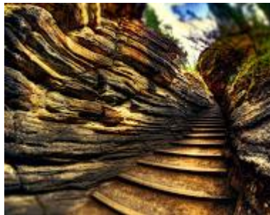
1. Mysterious Way