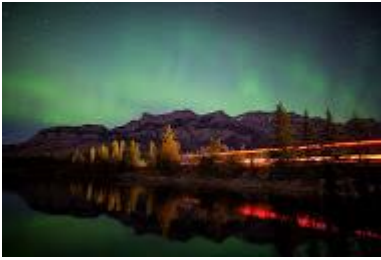
1. Back to the Future ©Bill Trout