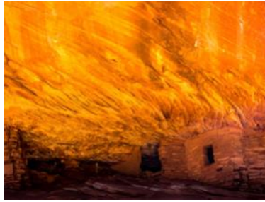
1. Inferno ©Wendy Royer