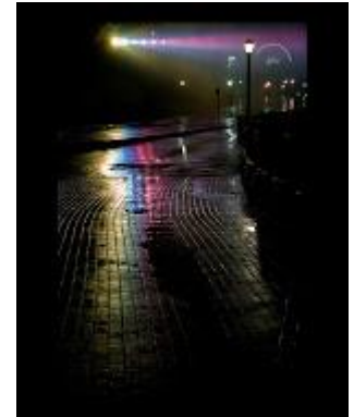
3. In a Lonely Place ©Arghya Basu