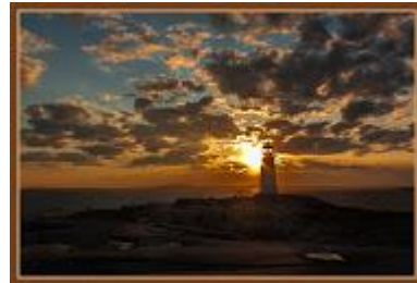
3. Sunset