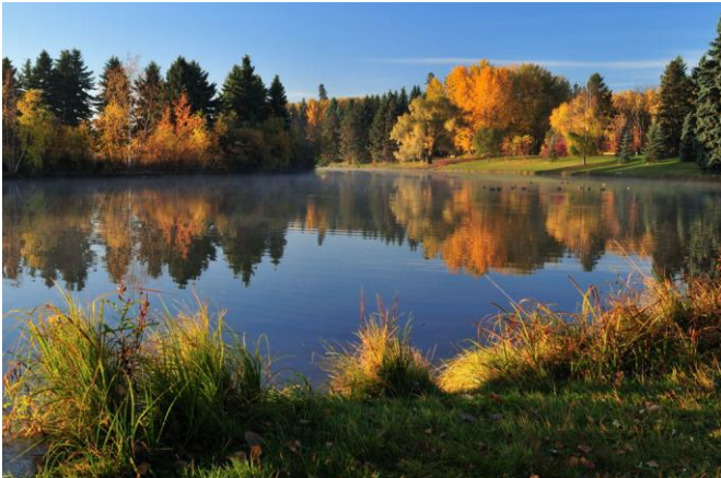
Istockphoto samples: four best-selling images