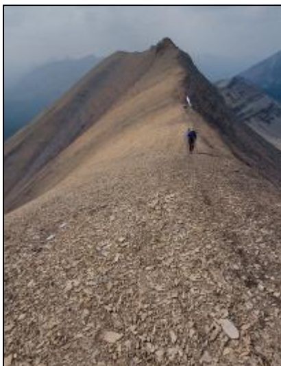
Willmore Ridge