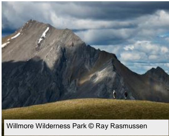
Willmore Wilderness Park

Hopefully Ray's presentation will influence your landscape photography. If you were interested in seeing more of Ray's work in Utah, he has provided the following two links: http://raysweb.net/utah/utah_f10 http://raysweb.net/utah/utah_s11/