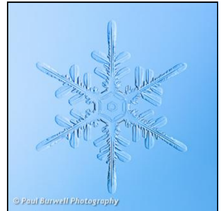
24" x 24" Aluminum Print By Paul Burwell

Saturday, December 10, 2011 - Sunday, December 11, 2011 , Admission $10 5:00 PM - 9:00 PM