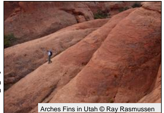
Arches Fins in Utah

What we learned by the end of the evening was that a human figure in the scene adds scale as it is an identifiable size for the viewer. We can see that the photographs on this page each rely upon the human figure to accurately portray the size and distance of the landscapes. Ray prefers to use human forms that are small so that they don't dominate the landscape. We saw that his people are not identifiable or facing the camera so the viewer doesn't make a visual connection with the 'person' while at the same time they provide a personal connection to the landscape.