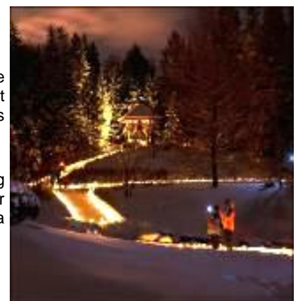
'Photographers at Luminaria' by Fred Rushworth