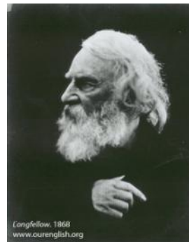
Langfellow, 1868 Alfred Lord Tennyson—Poet "Tis better to have loved and lost...."